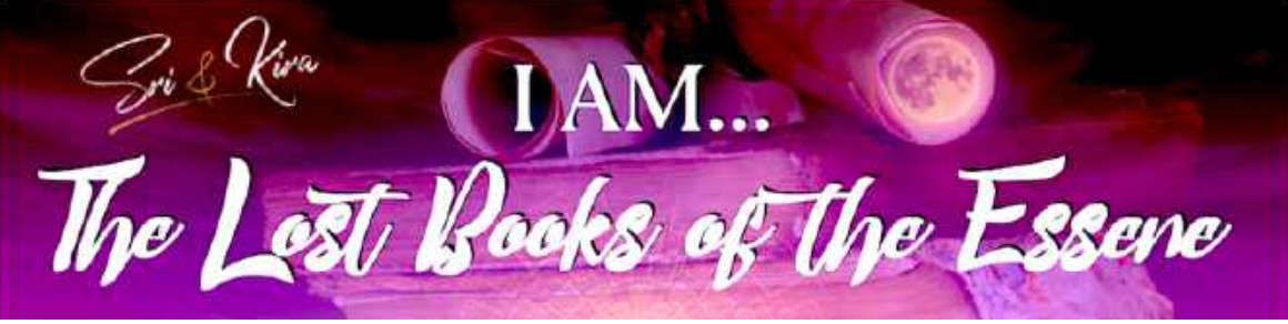
The Ceremony of Divine Reconnection

BE-loved Ones, we offer you this journey. In the ancient times as you call them, and in a timeless world, it would be now; would it not , on your journey through earth school... here<sup>3</sup>... you would congregate at night when the stars were out.