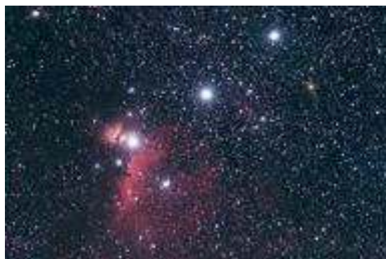
The three by three.

Meaning, you enter the ninth-wave when you ignite the infinite trinity by the infinite trinity – the three by three.