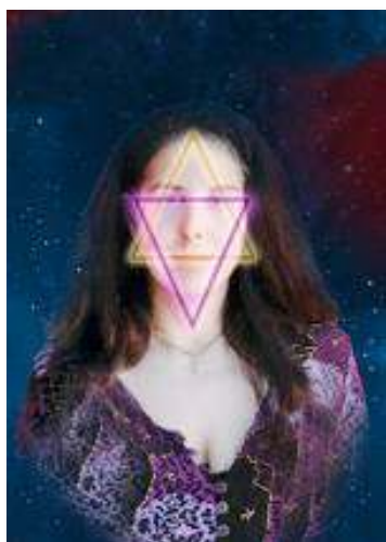
This illustration shows the top and bottom placement of the Facial Merkabah

This is the top and the bottom of the middle trinity of the facial merkabah. This merkabah is one of several merkabahs that encompasses the body, for there are many . Yet igniting this merkabah ignites greater recognition and eases the birth that is upon thee.