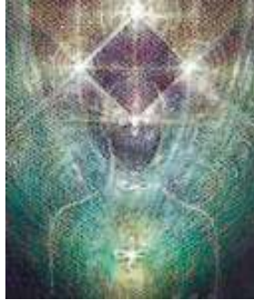
The Exploded Crown Chakra, (above), of the Divine Galactic Blueprint- shown in Violet

This energy, if you were to bring the two fingers, the middle fingers of your hands to this point on the heart center and you feel these two middle fingers as the ignition of the discus, if you were to breathe into this finger and feel golden energy come forward, you begin spinning the cosmic body which begins here, connects through the temples, continues above the head to the area that you call the exploded crown.